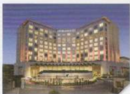
J W Marriott Hotel

A choice of 5-star business hotels with attractive packages have been lined up for you. For package details, visit: www.iijs.org or write to us at hotels@gjepcindia.com .